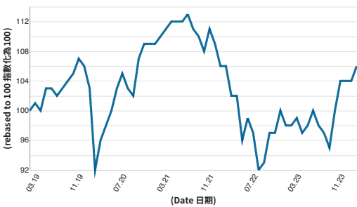
Fund A-USD A股-美元

The fund aims to achieve moderate capital growth over the medium to long term and provide income. The fund invests in a range of asset classes, including debt securities, equities, real estate, infrastructure, commodities and cash from anywhere in the world, including emerging markets. The fund invests at least 70% of its assets in securities of companies with favourable environmental, social and governance (ESG) characteristics. (Please refer to the offering document for Investment Objective of the fund) 基金旨在於中長期內實現溫和資本增長並提供收益。基金投資於世界各地（包括新興市場）的一系列資產類別，包括債務證券、股票、房地產、基建、商品和現金。基金將最少70%的資產投資於具有有利環境、社會和管治（ESG）特徵之公司的證券。（關於基金的投資目標詳情請參閱基金章程）